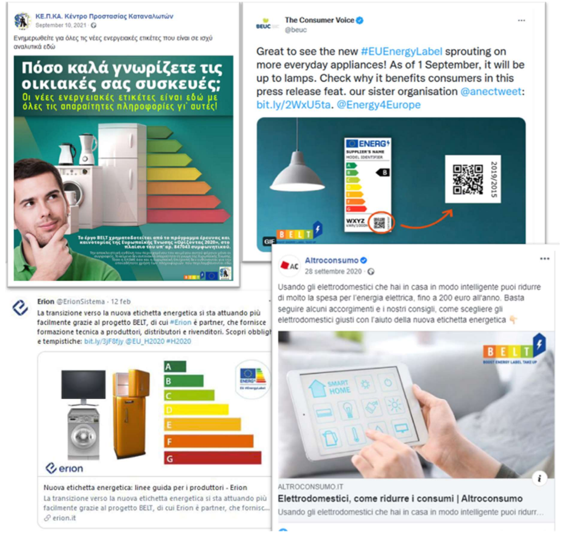
Figure 1: Examples of social media posts on the topic of the new energy label created by the BELT partners and linked third parties.