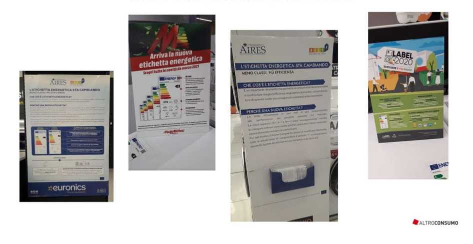
Figure 3: Slide shared by Altroconsumo during the webinar of 22 September 2021.